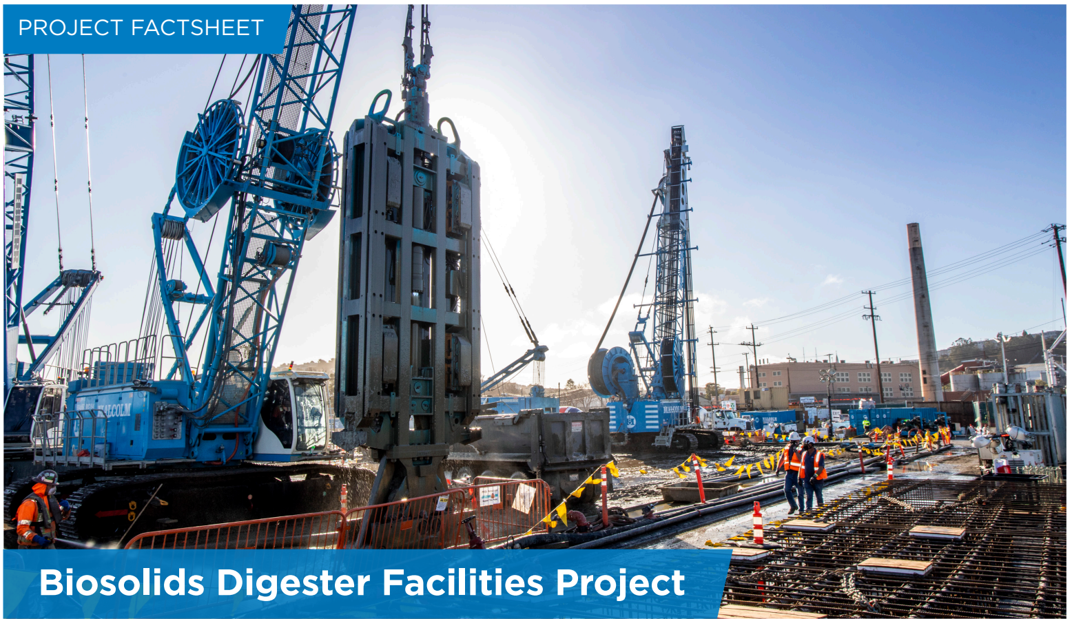
Pictured above: Biosolids Digester Facilities Project Construction