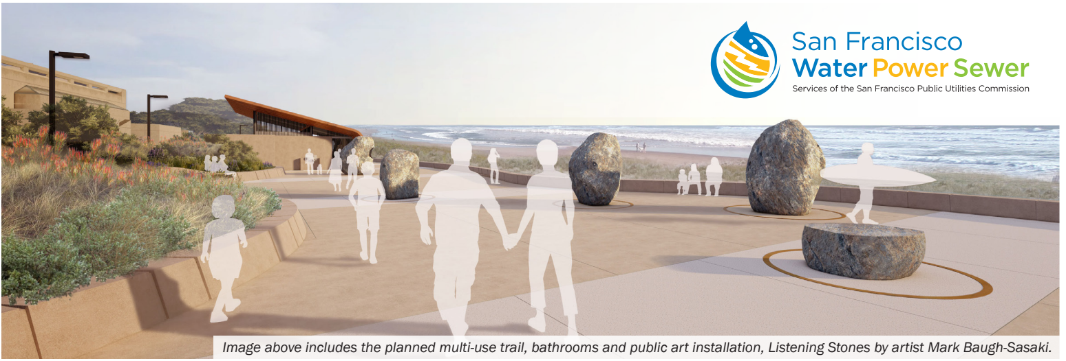
Image above includes the planned multi-use trail, bathrooms and public art installation, Listening Stones by artist Mark Baugh-Sasaki.