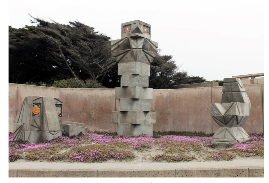
Existing public art installation, Earth Air Sea, by Mary Fuller, commissioned in 1986

To meet the goals of the Sewer System Improvement Program (SSIP) Levels of Service (LOS) goals, a condition assessment of the WSS was conducted, and the following vulnerabilities were identified: inadequate cooling of electrical equipment; deficient solids screening; inefficient and labor intensive solids handling; equipment that is past its useful life or damaged by the corrosive environment; redundancy vulnerabilities; and a lack of back-up electrical power service. Improvements and modifications are needed to ensure the WSS is reliable and operationally flexible, that it contains equipment redundancy, and remains compliant with State and Federal regulations.