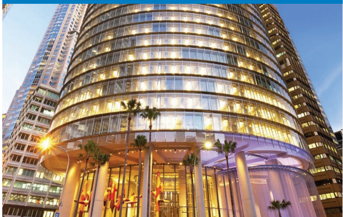
1 Bligh Street