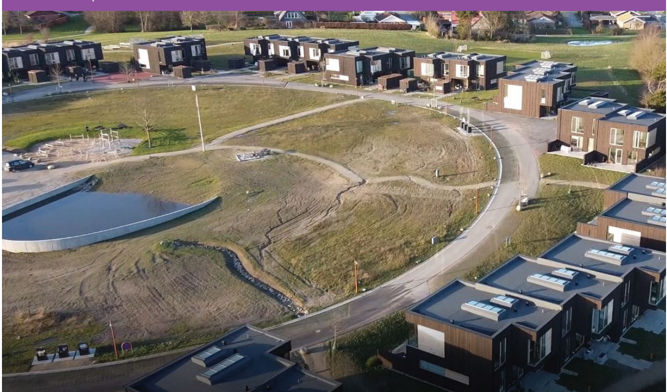
Homes surrounding Nye's central lake/storage reservoir