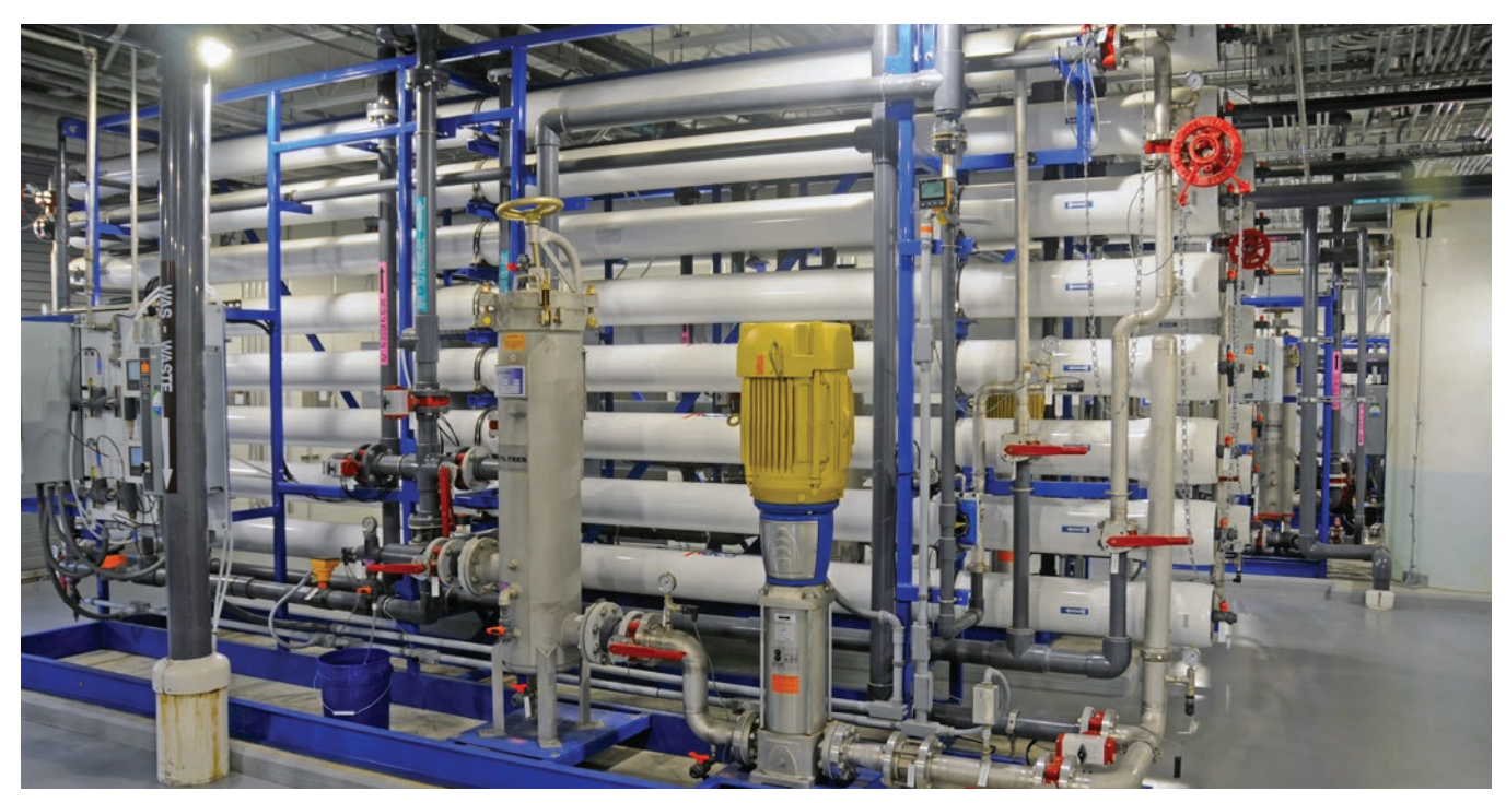
An onsite reuse system's mechanical room