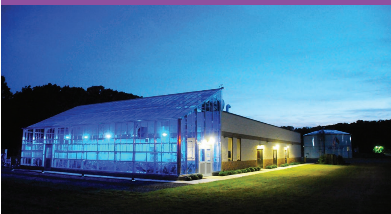
The WaterHub's greenhouse, administrative building, and reclaimed water storage tank