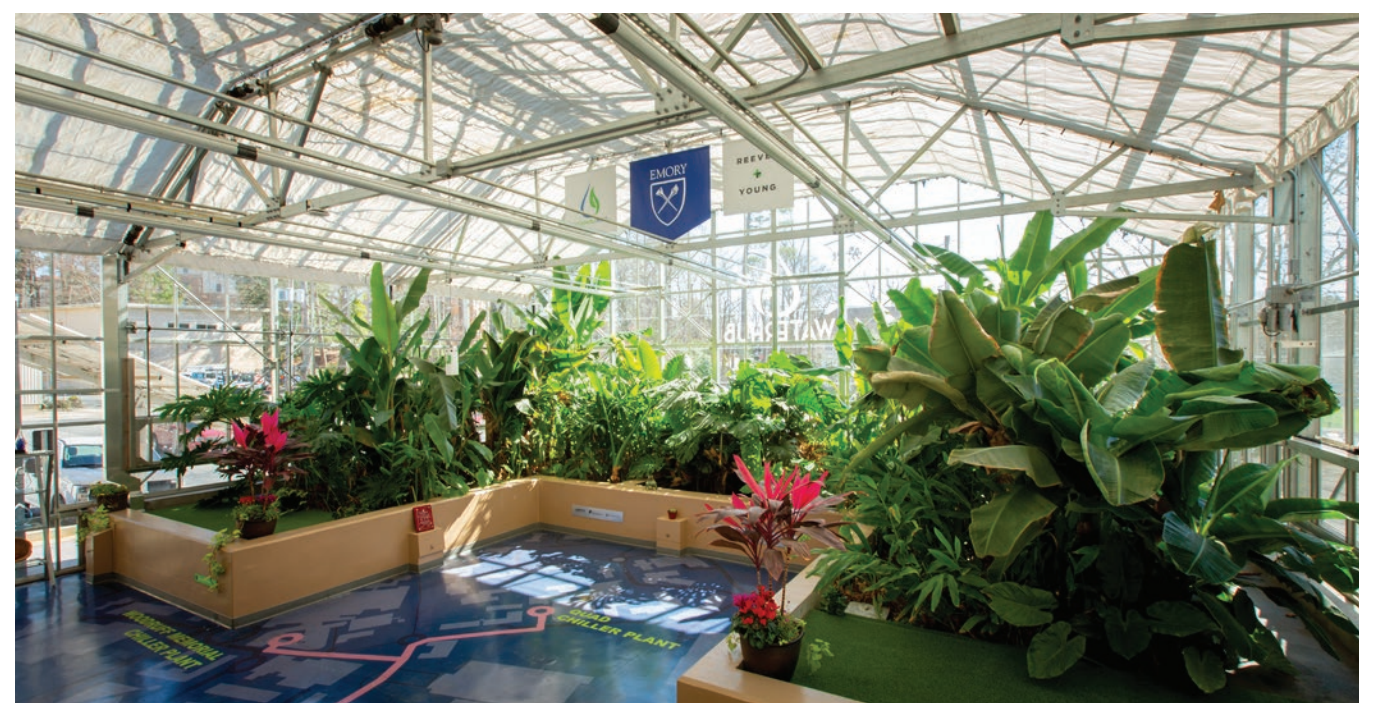
Interior of the greenhouse

Reference: Bob Salvatelli, Sustainable Water (bob.salvatelli@sustainablewater.com) (973) 632-8560