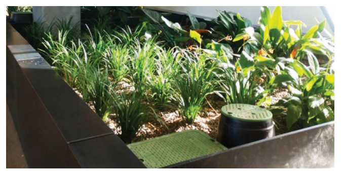
2nd stage of wetland treatment in building's interior

Rainwater capture at this scale is also prohibited by Colorado water law. Denver Water planners and attorneys filed, argued, and won a case in water court by promising to replace the volume of rainwater