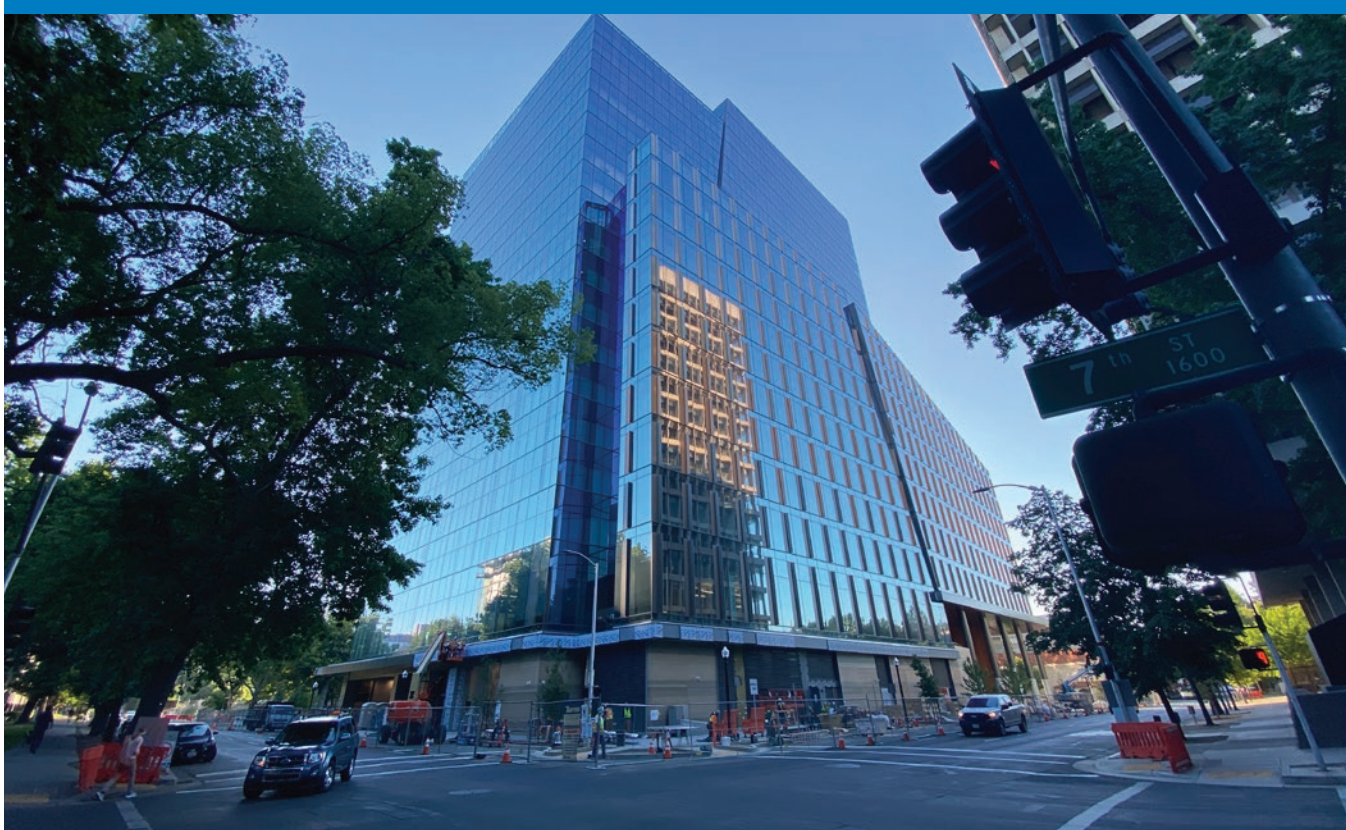
DGS Natural Resources Building under final stage of construction

Project Status: Under Construction (Estimated Completion Late 2021)