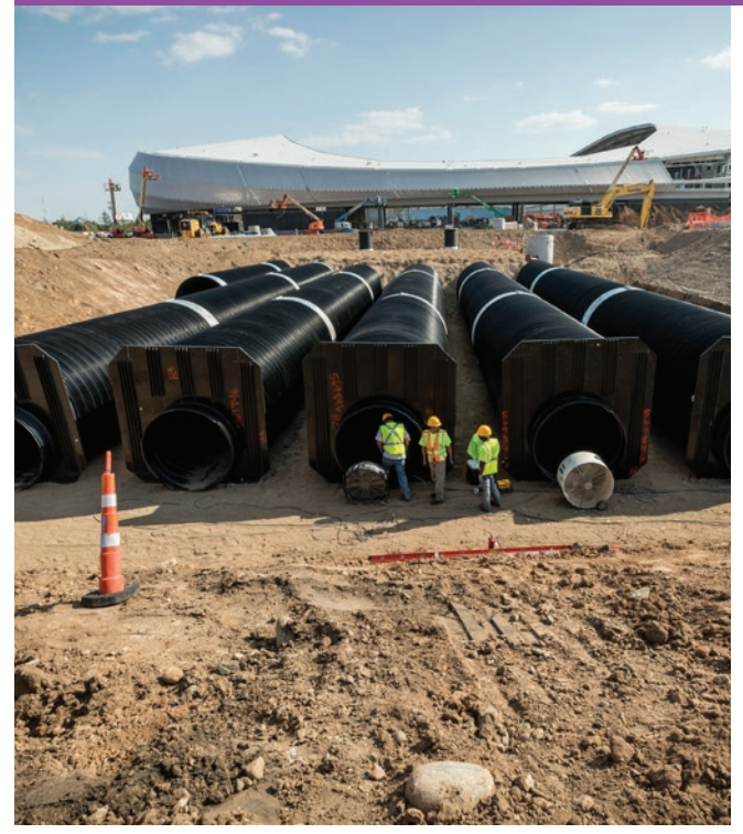
Installation of underground rainwater storage tank outside of stadium