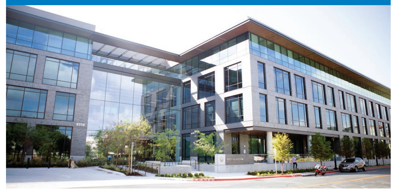
City of Austin Permitting and Development Center