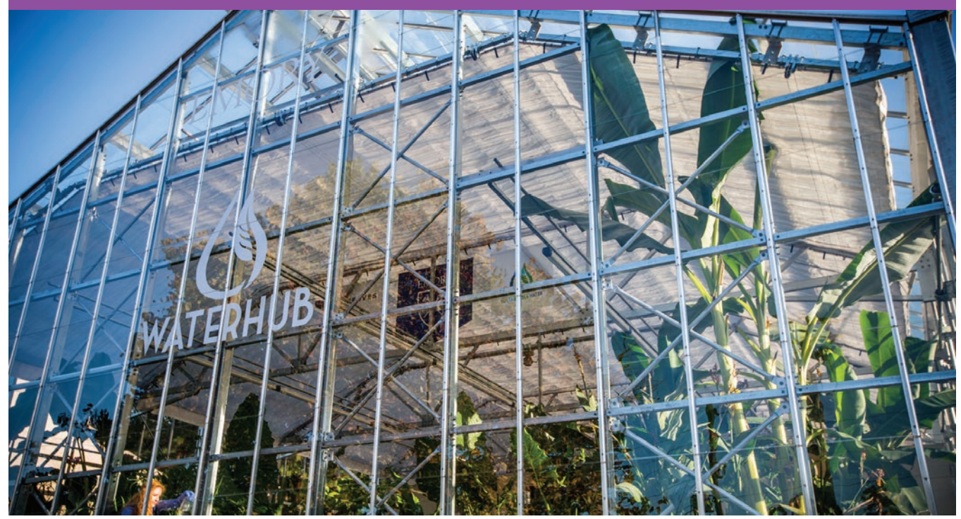
Exterior of the WaterHub greenhouse at Emory University