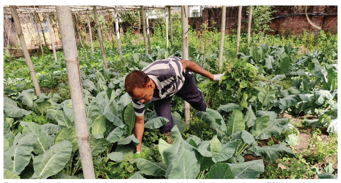
The orphanage farm utilizes recycled water for irrigation and treated bio-solids for soil fertilizer

Reference: Rajendra Shrestha, Environment and Public Health Organization (ENPHO) (rajendra.shrestha@enpho.org) (977-1-5244641, 5244051)