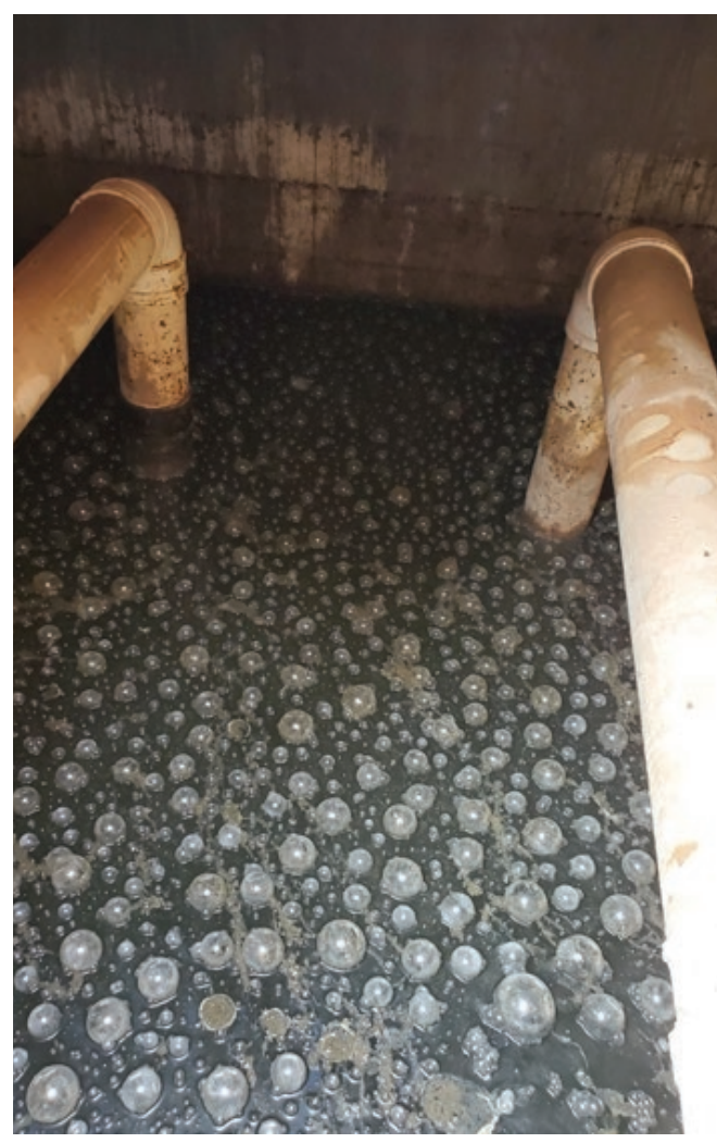
Tarabo anaerobic treatment at work

Support to facilitate the construction and operation.