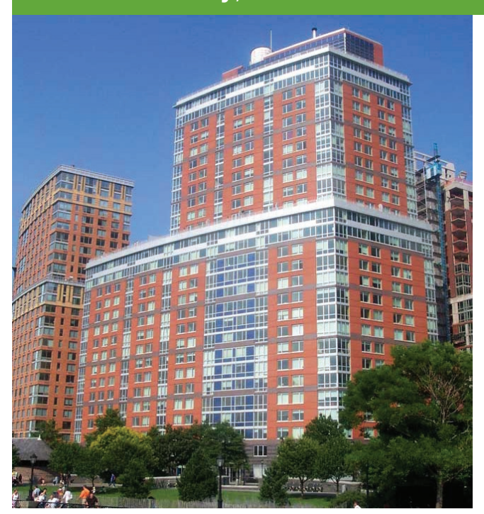
The Solaire residential tower