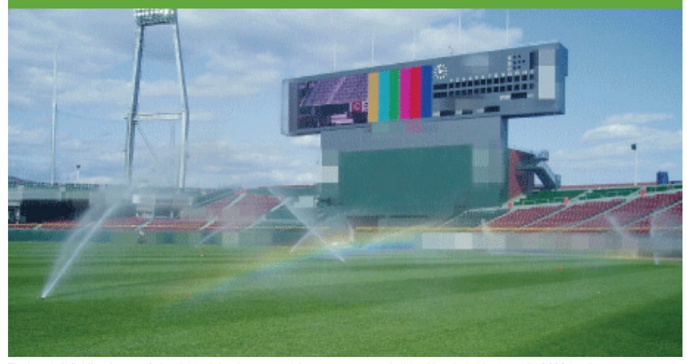
The baseball field's rainwater fed sprinkler irrigation system