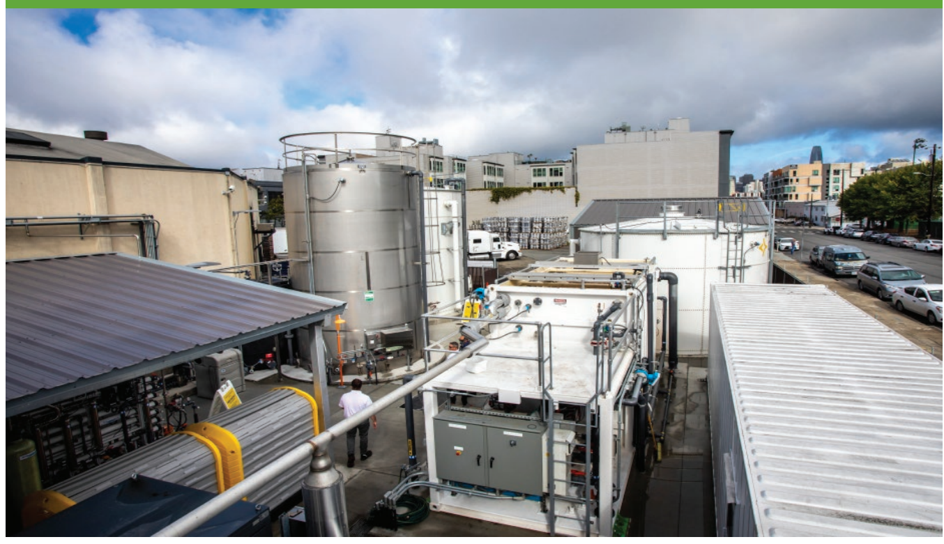
Anchor Brewing Company