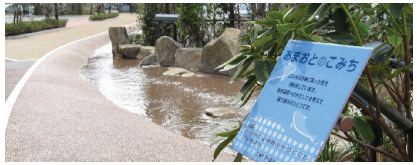
The circulating playground water feature "Amaoto No Komichi"