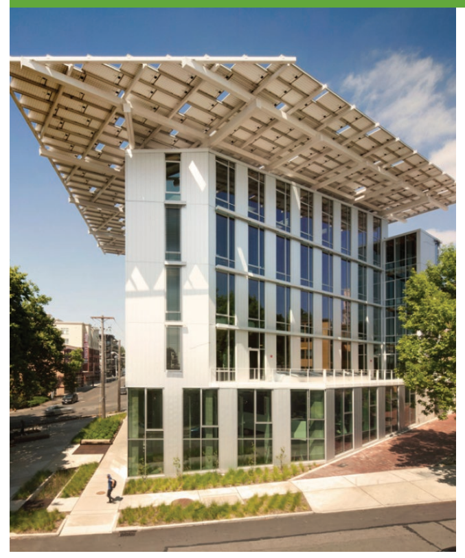
The Bullitt Center