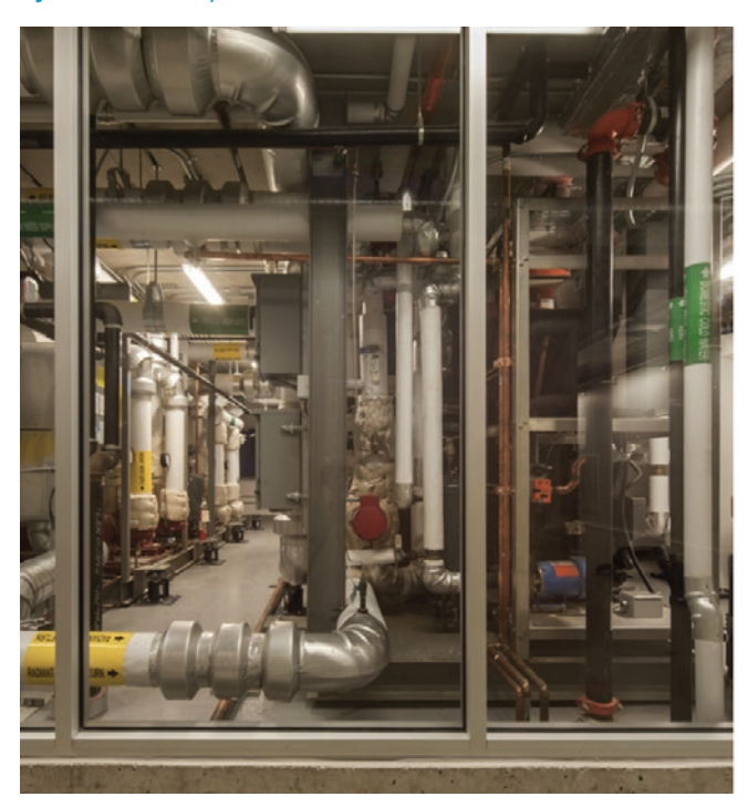
Onsite reuse system (image from Gray & Osborne Inc., Consulting Engineer's Bullitt Center Water Treatment System Engineering Report)

Additional Information: https://bullittcenter. org/2018/11/01/rainwater-to-potable-watersystem-is-live/