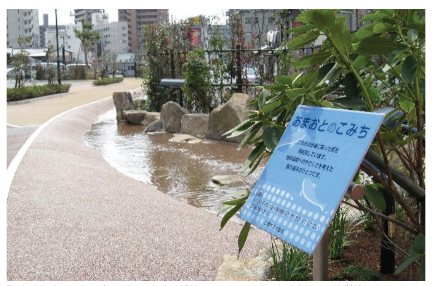
The circulating playground water feature "Amaoto No Komichi"

Reference: Hiroshima City Government, Sewerage Bureau, Facility Management Department, Planning and Management Section (g-keikaku@city.hiroshima.lg.jp)