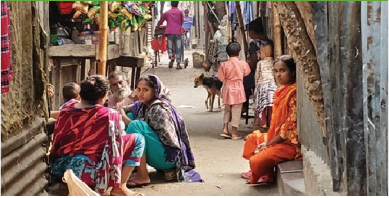
Vashantek community post installation