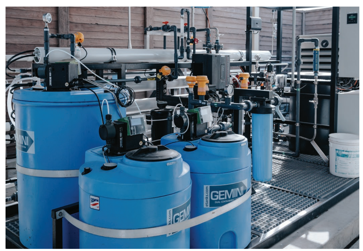
Treatment system RO skid

This report highlights developments in San Francisco, as well as other national and international projects, that have incorporated innovative technologies to reuse water and recover resources. Opportunities exist for buildings to not only recycle water onsite, but become vehicles for resource recovery, tapping into the potential for thermal heat, nutrient and biosolids recovery as well as a potential source of drinking water. These projects are providing multiple benefits, encouraging testing of forward-thinking ideas, and promoting opportunities to develop partnerships. Information about San Francisco's Innovations Program is available at sfpuc.org/programs/future-water-supply-planning/innovations. More information about San Francisco's Onsite water Reuse Program is available at sfpuc.org/construction-contracts/design-guidelines-standards/ onsite-water-reuse.