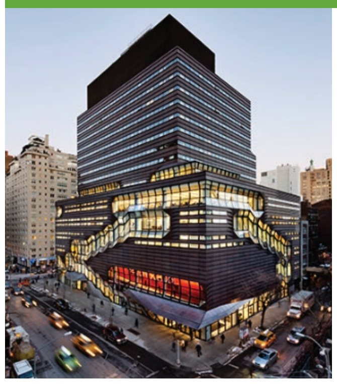
The New School's University Center