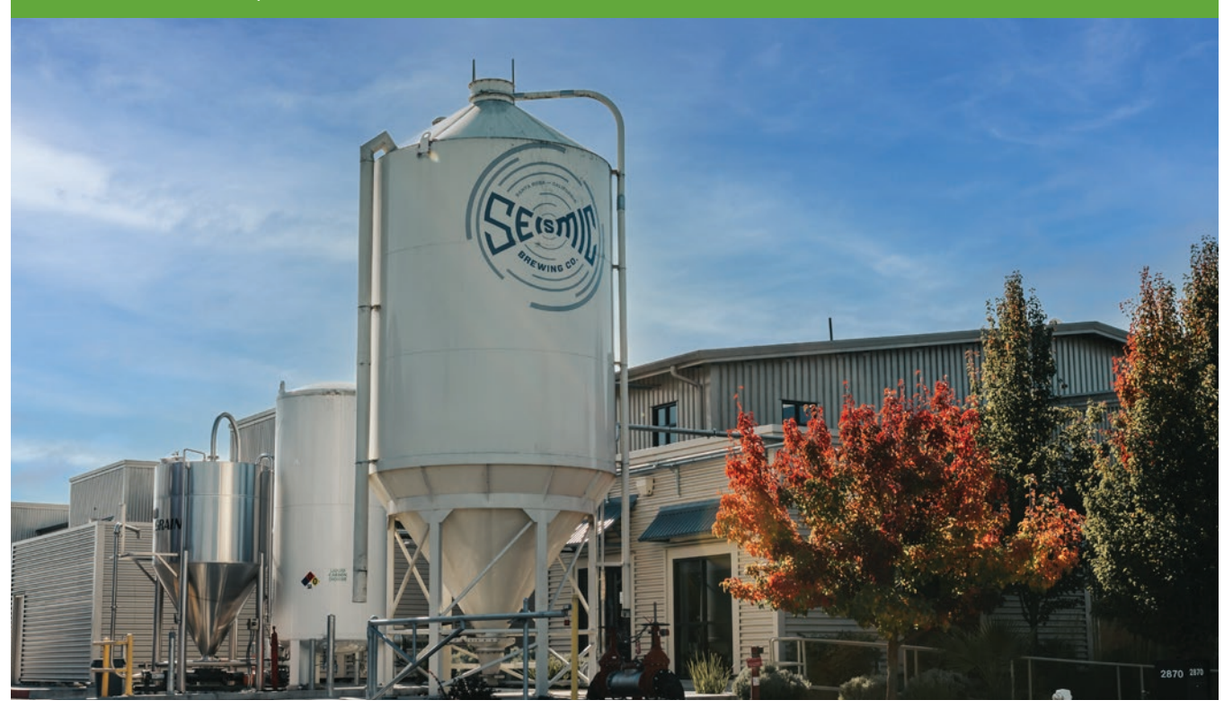
Seismic Brewing facility