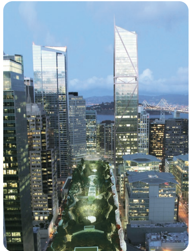
181 Fremont is a mixed-use residential building capturing graywater and rainwater, treating, and reusing it for toilet flushing and irrigation.