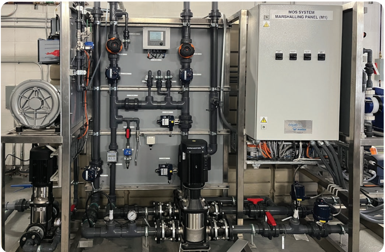
Mission Rock's district-scale blackwater treatment system is the first of its kind in San Francisco. The system will meet all of the demands for toilet and urinal flushing and irrigation and is estimated to offset about 55% of the development's total water demand.