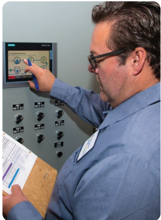
The Treatment System Manager can train building staff to perform routine inspections and maintenance.