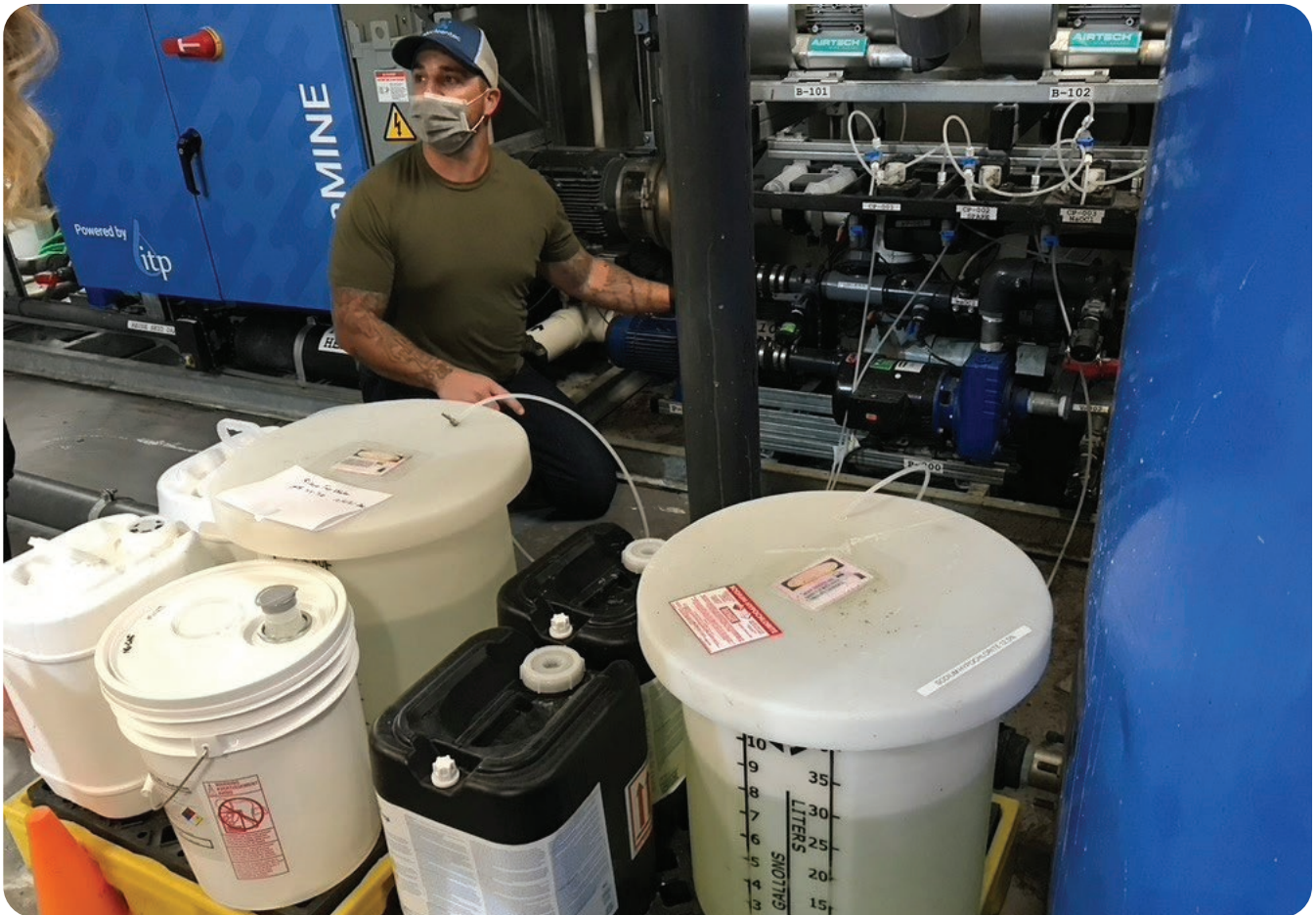
The Treatment System Manager of the combined graywater and rainwater treatment system at 1550 Mission uses chlorine to maintain a disinfectant residual to provide protection against opportunistic pathogens such as Legionella.