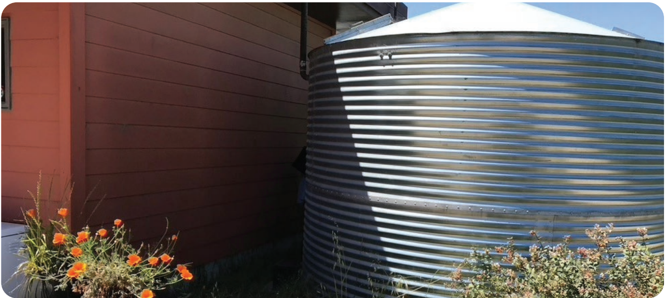
The EcoCenter at Heron's Head Park is showcasing sustainability with its own solar energy system, living roof, and onsite rainwater harvesting.