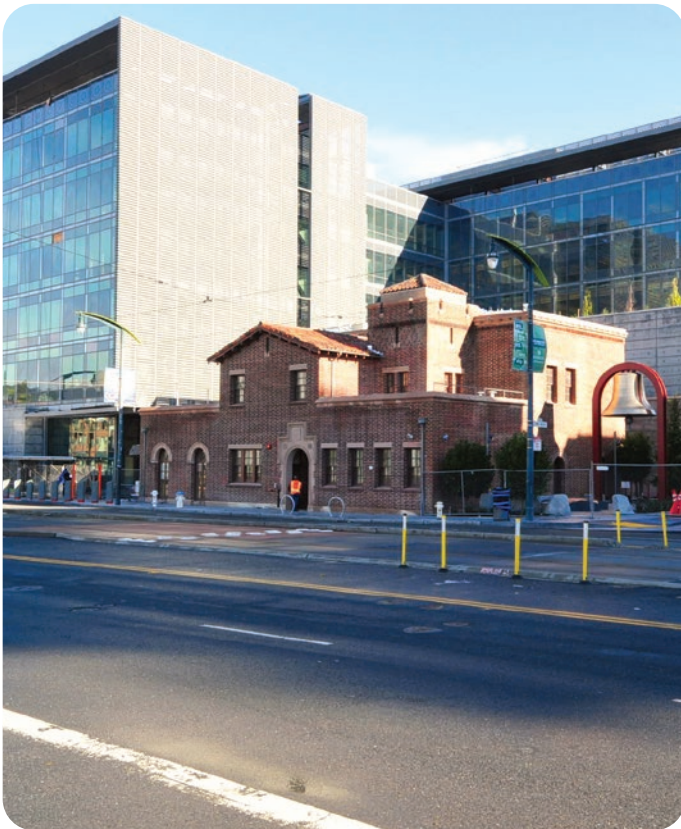
San Francisco's Public Safety Building operates a rainwater system that treats rainwater collected from the roof for sub surface irrigation and cooling tower makeup