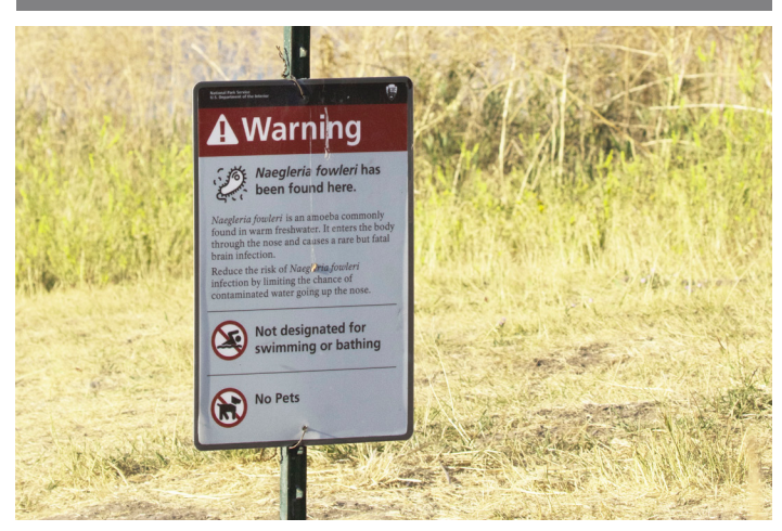
Warning sign of Naegleria fowleri.

For more detailed instructions, please visit: cdc.gov/parasites/naegleria/tap-faucet-water.html