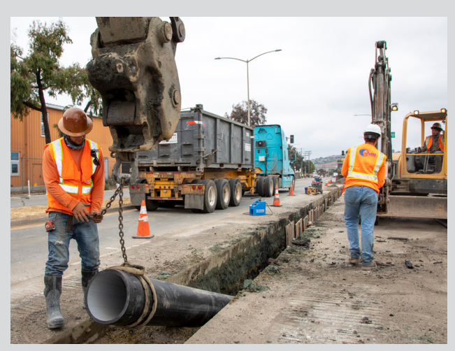
Cargo Way Box Sewer Odor Reduction Project: 14-inch HDPE (High Density Polyethylene) pipe being lowered into the trench. Pipe is being joined together by electrofusion couplings. Contractor is excavating for one pipe at a time and then pipe is installed due to the bad ground conditions.