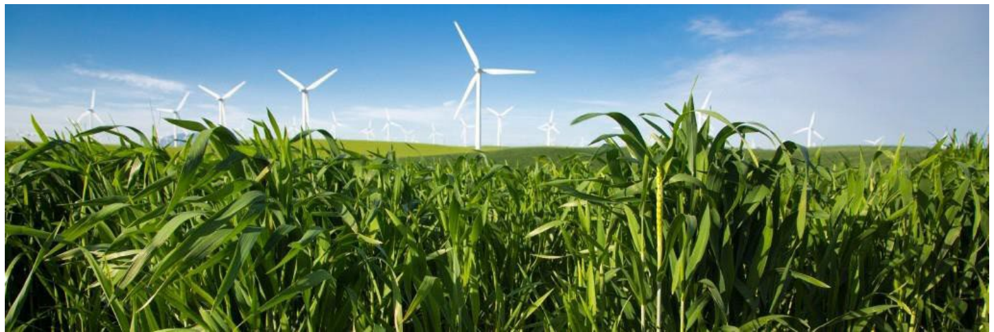
Bay Area ranch where SFPUC biosolids are used as a soil amendment