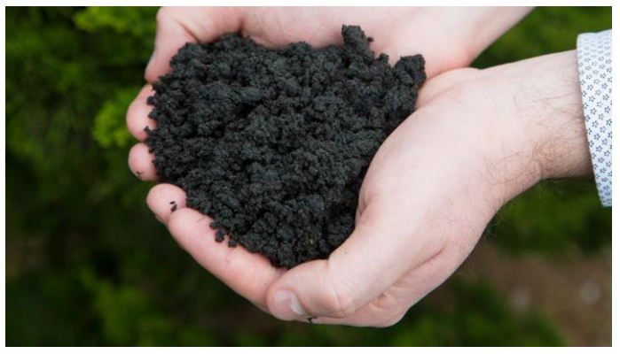
SFPUC process engineer, holding biosolids produced at the Oceanside Treatment Plant